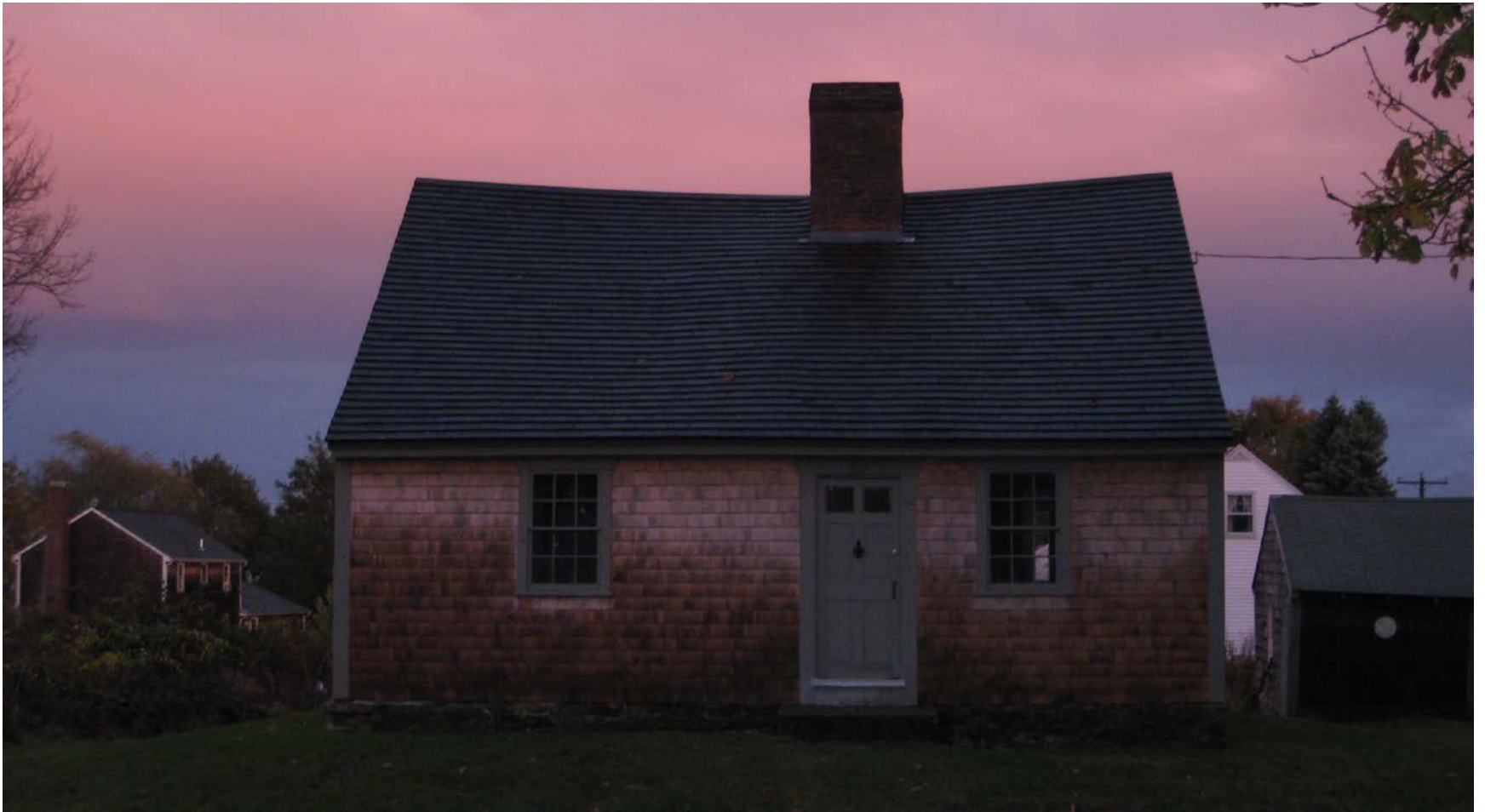
The Akin House, November 2008