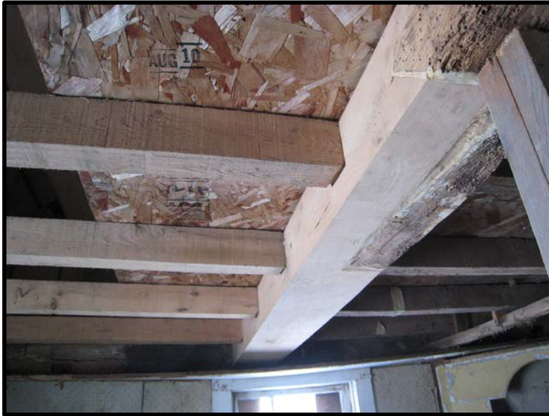
After Phase I