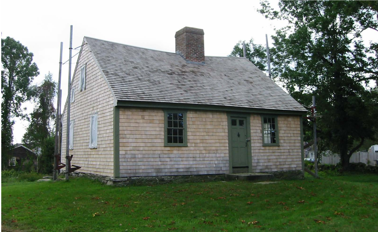
The Akin House, 2006