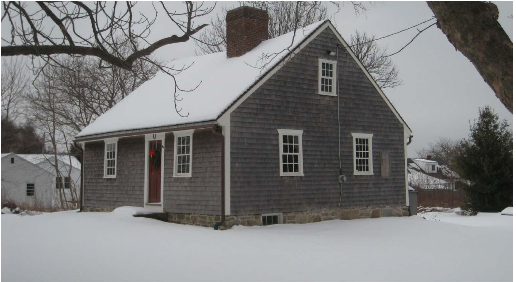
The Akin House, Christmas 2011