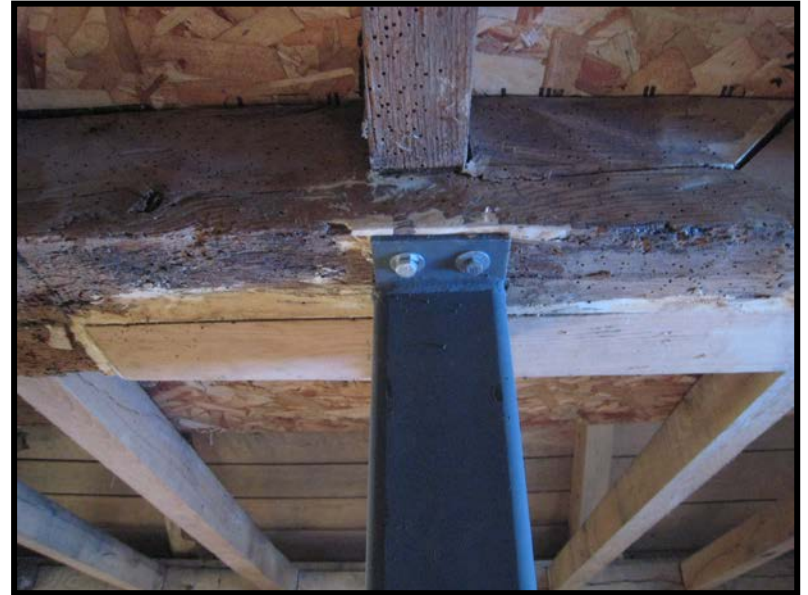
After Phase II

Summer Beam: The largest timber of a house into which the joists are framed. Summers were used to break the span between walls by running at right angles to the joists. [Friedland]