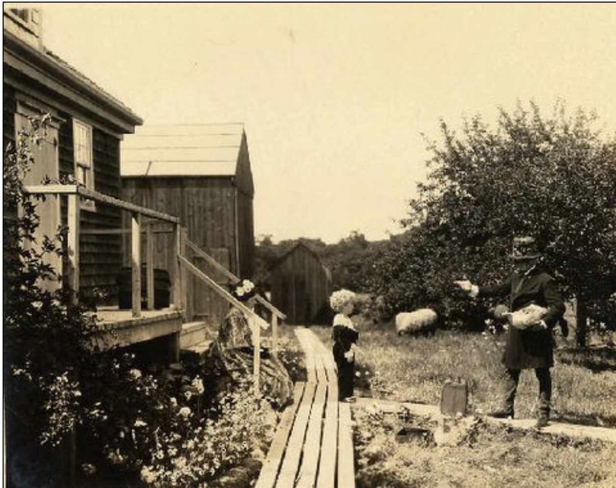
Frame from Elmer Clifton's 1921 silent film, "Down to the Sea in Ships" to illustrate the east side (or rear entry) of the Akin House. Note the deck and stairway with boardwalk towards barn and outbuilding. This entry configuration is likely at least 100 years old.