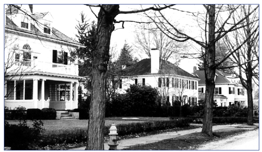
Massachusetts Avenue Historic District, Worcester, both a Local and National Register Historic District