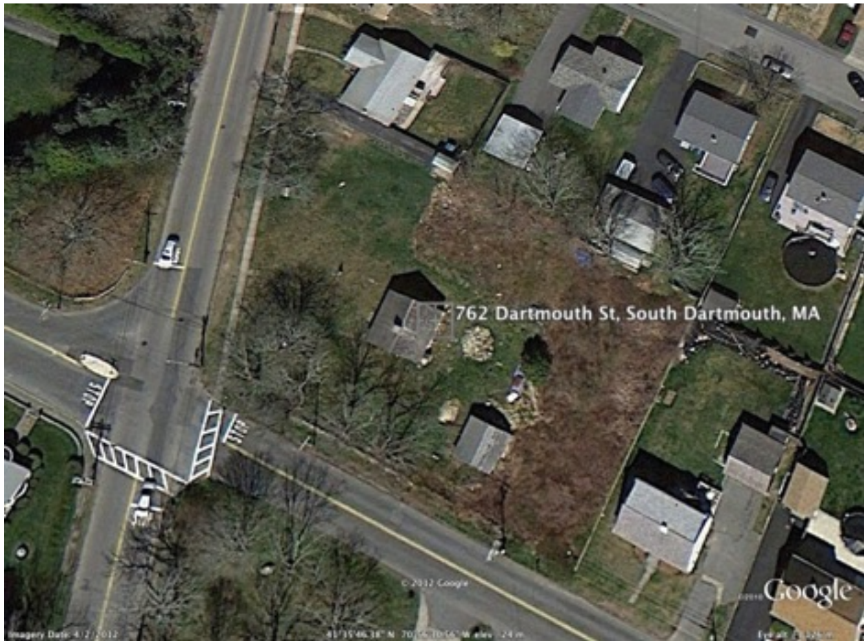
A View of the Akin House Property as It Stands Today at the Intersection of Dartmouth and Rockland Streets