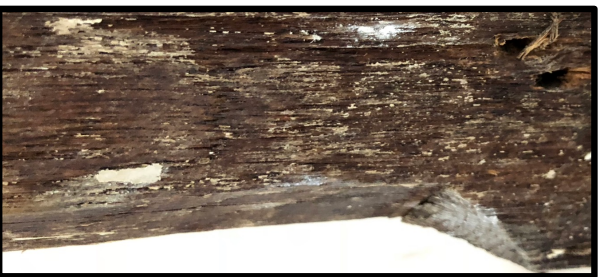
Details of the original construction

Upper left: original floorboards left exposed to contrast with the new. Chamfered timbers from the 17<sup>th</sup> & 18<sup>th</sup> centuries could have been elaborate or very simple depending on the house building style and always a function of capabilities of craftsmen and affordability. These original chamfered joists harken back before 1762.