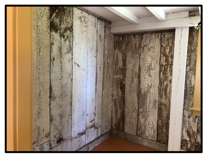
Above: View of the Borning Room paneled with original white washed boards. This room will be used as a library, for research, and small scale interpretive presentations using technology.

Above: The Buttery has been outfitted with shelves to display pottery, crockery, jugs, dishes, baskets, cooking utensils and other tools typically used by inhabitants of the period. The shelves were made with wood discovered in the upper eaves of the second story. The Buttery will be furnished as vintage items are purchased, found, or donated.